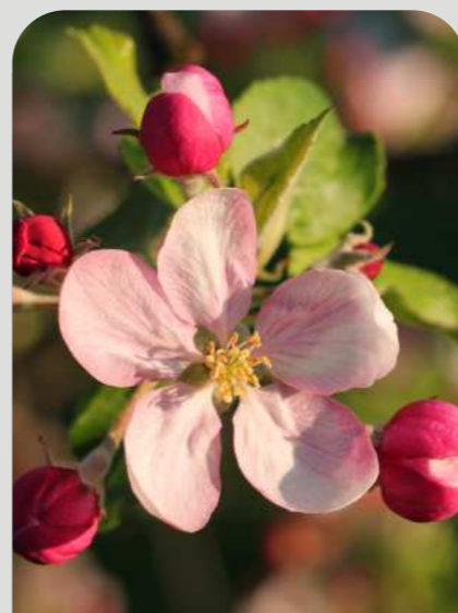
PINK BUD FLOWERING